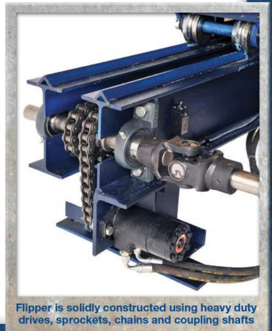
Flipper is solidly constructed using heavy duty drives, sprockets, chains and coupling shafts

The Flipper is designed for simple self-installation of the system for the fabricator.