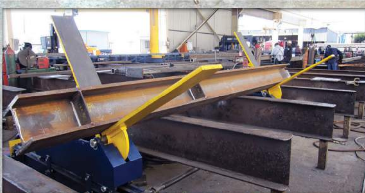
The Flipper maneuvering a heavy column

The Ocean Flipper is a simple and unique material handling component, specifically designed to fit within the material support tables of the Ocean Avenger and other single-spindle drill lines, or other types of steel processing equipment where turning and positioning of profiles is required.